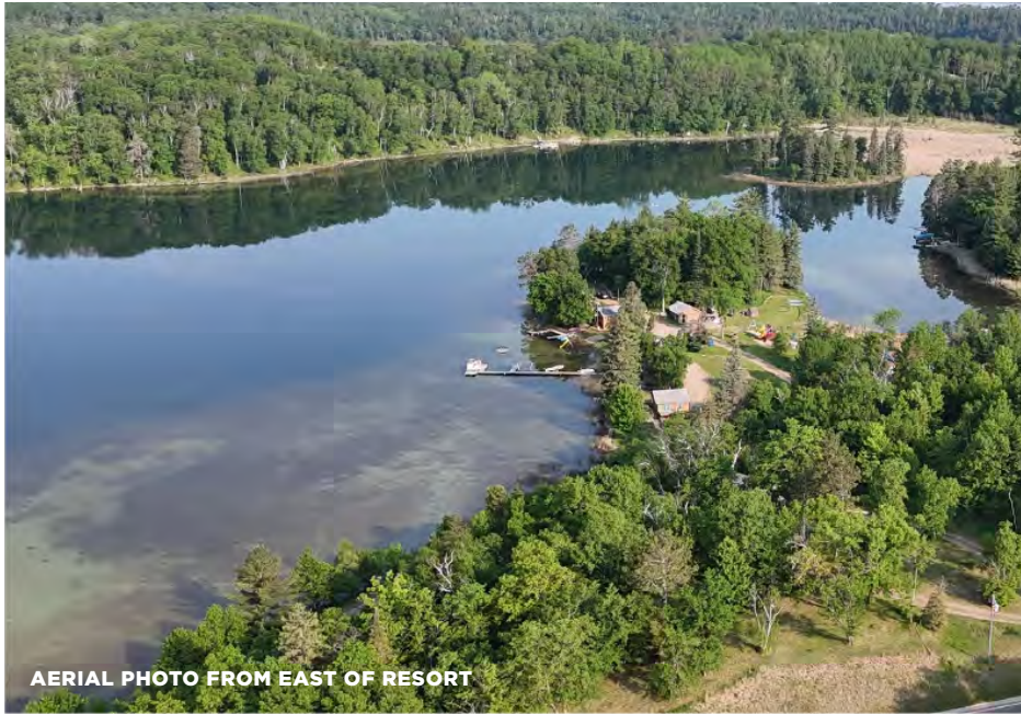
AERIAL PHOTO FROM EAST OF RESORT