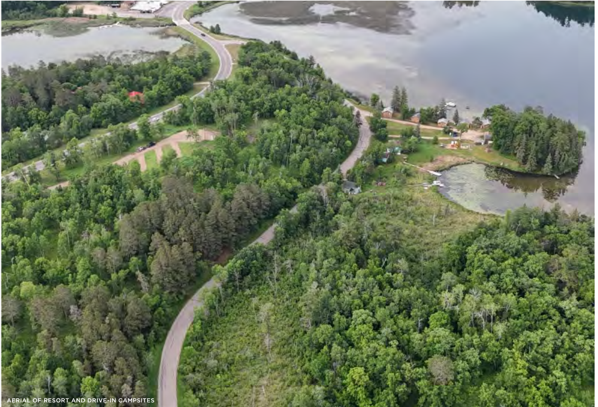
AERIAL OF RESORT AND DRIVE-IN CAMPSITES