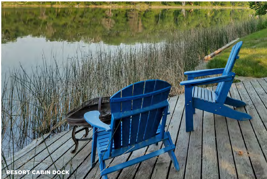
RESORT CABIN DOCK