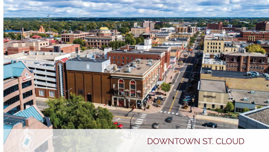
DOWNTOWN ST. CLOUD

St. Cloud is one of Minnesota’s fastest growing metropolitan areas with over 250,000 people in its region. Forbes.com ranked St Cloud 24th among 184 cities in the U.S. as one of the “Best Small Places for Business and Careers” based on job growth, costs of business and living, and income growth. With ample room for growth and a supportive infrastructure, St. Cloud is an attractive location for new business to break ground and for existing businesses to expand. St. Cloud boasts a highly skilled and educated workforce.